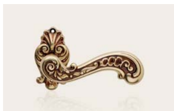
oro francese french gold OF