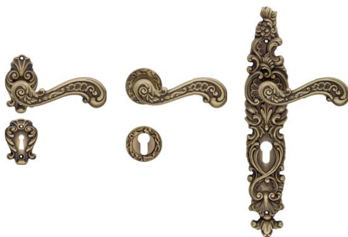
1520 RB 015