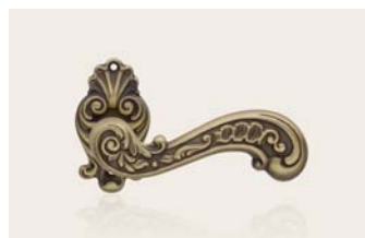
patiné patiné mat PM