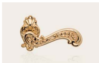
oro zecchino gold plated OZ